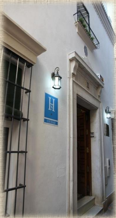
Hotel La Vía Mezquita

At the beginning of our internship we were stressed, but every day we were doing it better and finally we can talk to our bosses without many complications.