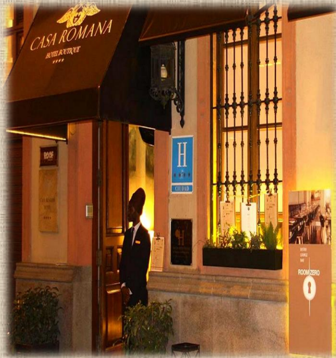
Hotel La Boutique Casa Romana